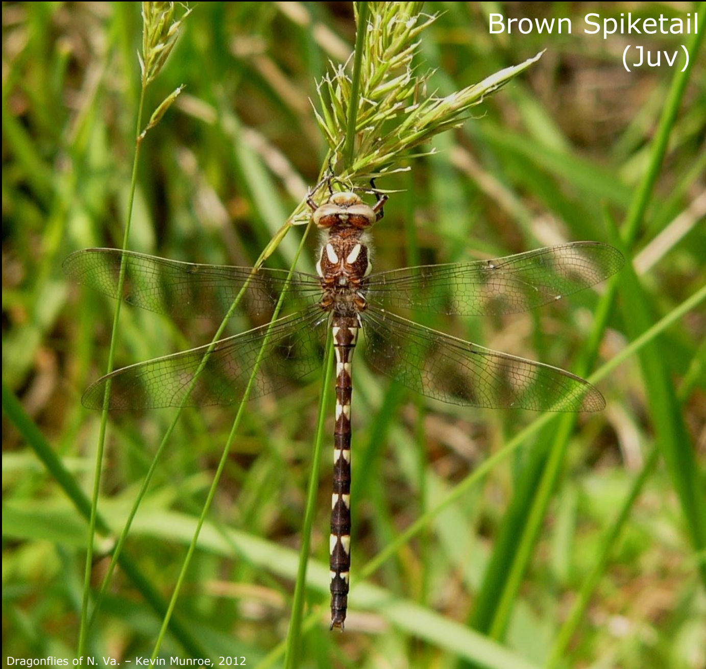
Brown Spiketail (Juv)